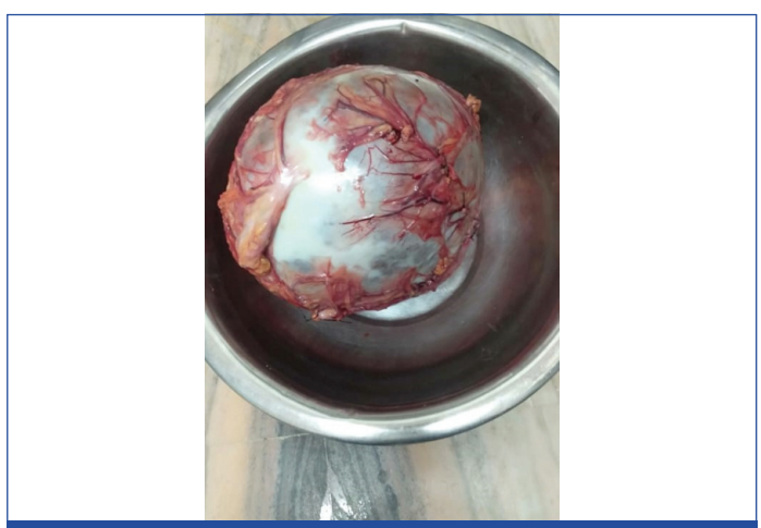
[Table/Fig-1]: Cystectomy specimen weighing 5 kg.

A cystectomy was carried out. The cyst was around 5 kg in weight [Table/Fig-1]. Intraoperative ascitic fluid and cyst fluid were sent for cytological study, the report of which showed reactive mesothelial cells. The specimen was fixed in 10% buffered formalin and sent for histopathological evaluation. The postoperative follow-up showed improvement in her symptoms and recovery was speedy. Ovaries and uterus were unremarkable.